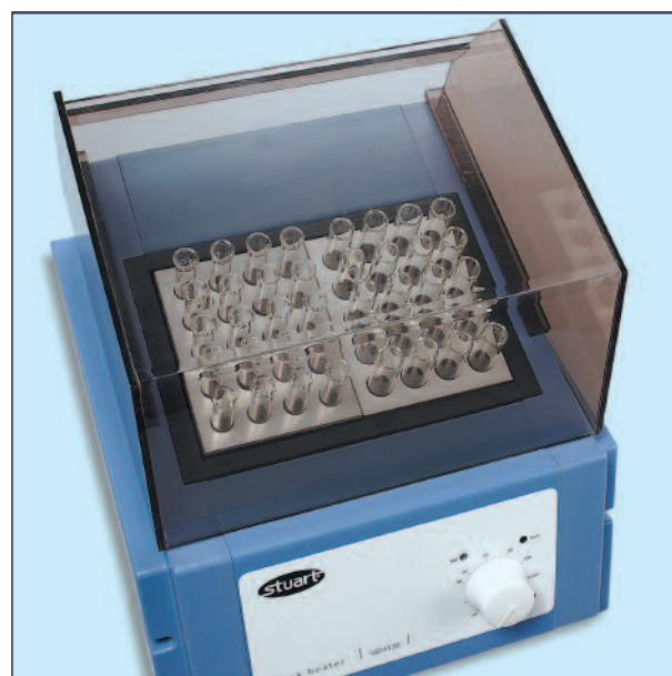
SBH130 with SBH/2