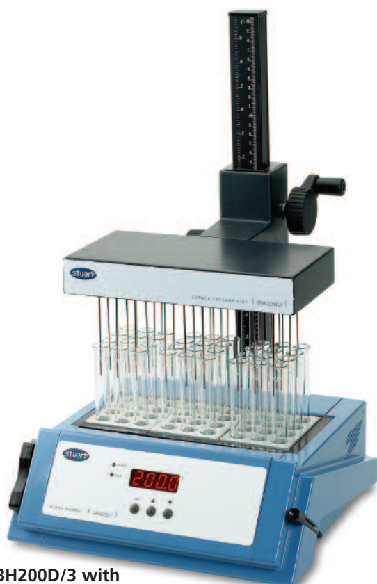
SBH200D/3 with SBHCONC/1

Note: Needles must be purchased separately.