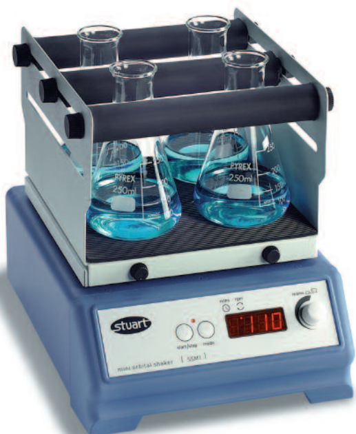
SSM1 with SSM1/1