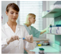
Clinics / University Hospitals