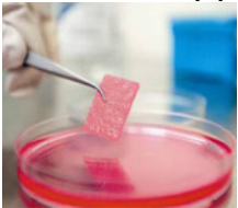
Bio Tissue Engineering