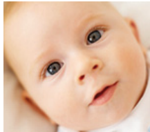
In vitro Fertilization (IVF)