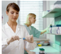
Clinics / University Hospitals