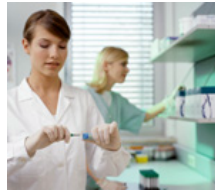
Clinics / University Hospitals