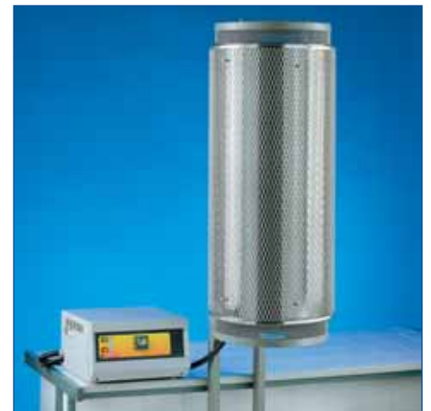
STF 15/610/3216P1 with vertical option L stand