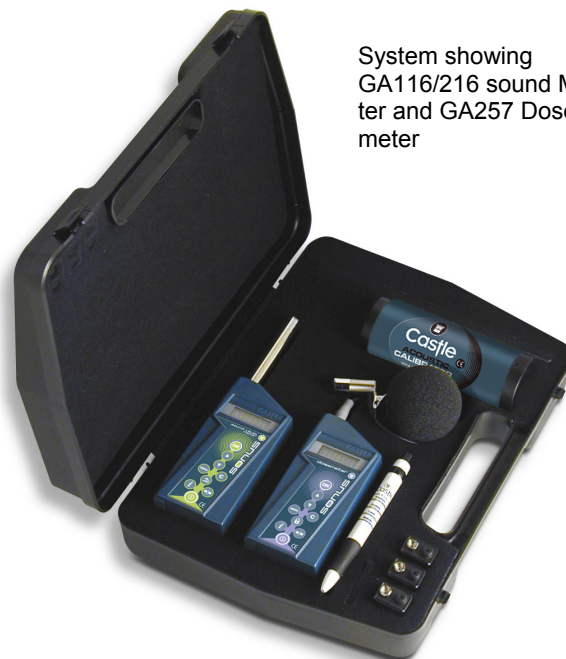
System showing GA116/216 sound Meter and GA257 Dosemeter