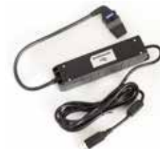
USB communications lead