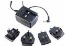
Multiregion power supply