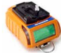
Pumped flow plate