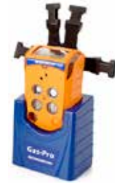
Chest harness straps