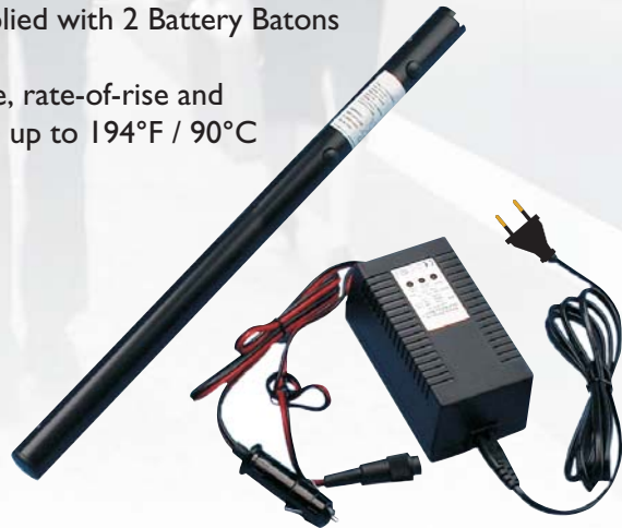
Solo 760 Battery Baton