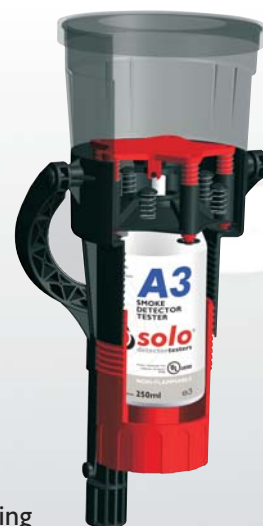
Solo 330 for use with Solo A3 & C3 Aerosols

Solo 332 is available for detectors with larger bases.