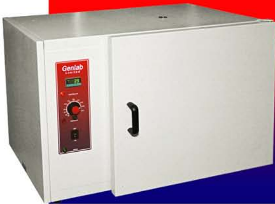
100 litre Oven with Digital Control OV/100/F/DIG