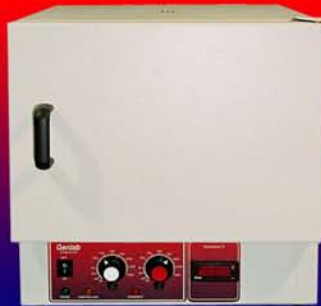
30 litre Oven with LED display MINO/30/LED