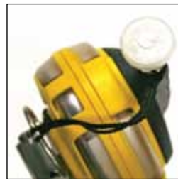
Auxiliary Pump Filter M5-AF-K2 / M5-AF-K2-100 Easily attaches with a quick connect fitting to provide additional pump protection