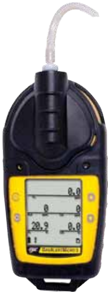
Concussion-Proof Boot GA-BM5-2 For GasAlertMicro 5 Series pumped units