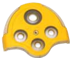
Replacement Diffusion Cover M5-DC-1