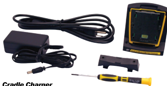
Cradle Charger M5-C01 Cradle charger for rechargeable battery packs