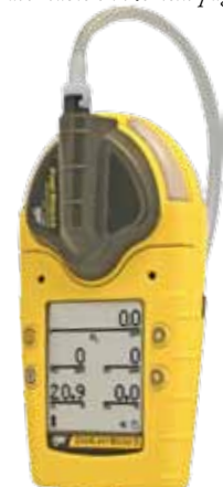
GasAlertMicro 5 Pump version