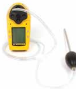
Manual Aspirator Pump GA-AS02 For remote sampling. Complete with probe, hose and aspirator pump