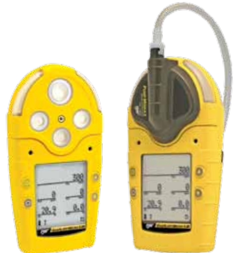
GasAlertMicro 5 IR Diffusion version with datalogging