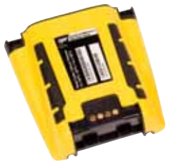
Rechargeable Battery Pack M5-BAT08/M5-BAT08B