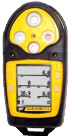
Concussion-Proof Boot GA-BM5-1 For GasAlertMicro 5 Series diffusion units