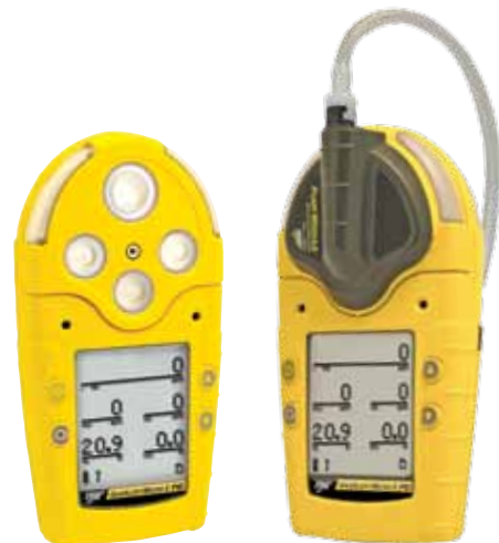
GasAlertMicro 5 PID Diffusion version with datalogging