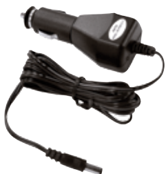
Vehicle Adaptor 12 Vdc GA-V-CHRG4 Vehicle adaptor cable for use with cradle charger (M5-C01)