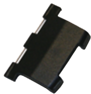
Replacement Battery Latch M5-BL-1