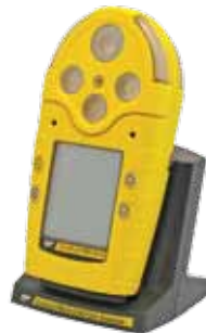
Cradle Charger Kit with Battery M5-C01-BAT08 / M5-C01-BAT08B Complete with charger and rechargeable battery pack