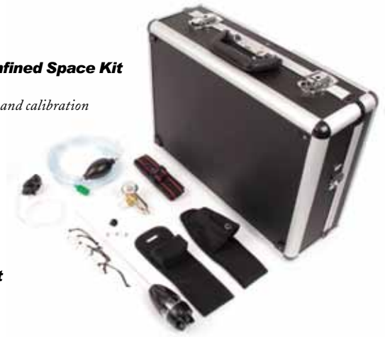
Deluxe Confined Space Kit M5-CK-DL Order detector and calibration gas separately