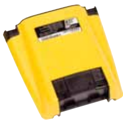
Alkaline Battery Pack M5-BAT0501/M5-BAT0501B M5-BAT0502/M5-BAT0502B

*Battery packs should be used with the new versions GasAlertMicro 5 Series gas detectors that have red circuit boards. See the Sensor Accessories, Spares and Replacements section for order information on batteries for the old version GasAlertMicro 5 Series gas detectors (green circuit boards).