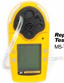
Replacement Test Cap and Hose M5-TC-1

*Change order number suffix "-N" to: "-E" for European versions, "-U" for United Kingdom versions, "-A" for Australian versions.