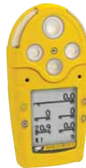
GasAlertMicro 5 Diffusion version with datalogging