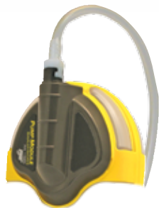
M5 Pump M5-PUMP