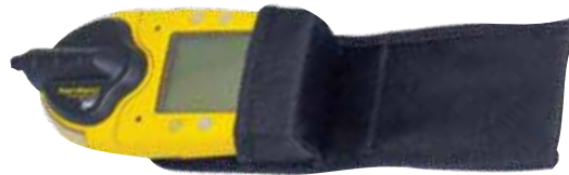
Carrying Holster GA-HM5 Fits securely on belt