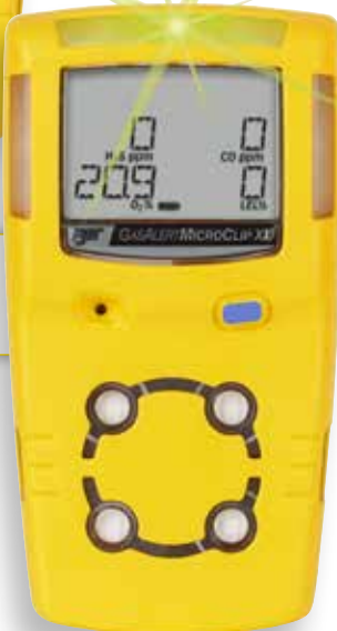
GasAlert MicroClip XL

NEW! GasAlertMicroClip X3 and GasAlertMicroClip XL now feature IP68 for maximum water and dust protection — up to 45 minutes at a depth of 1.2 m.