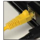
Easy to Network