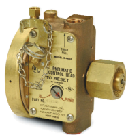
Electric & Cable Operated Control Head