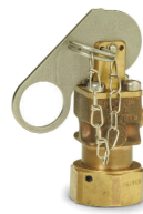
Lever & Pressure Operated Control Head