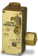
Electric Control Head