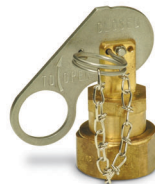
Lever Operated Control Head