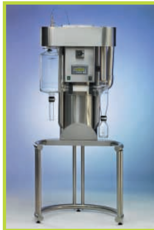
SD-06A Main unit on stand.

Most solutions and suspensions can be spray dried providing that the resulting product has the characteristics of a solid material.