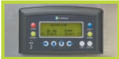
End of process.