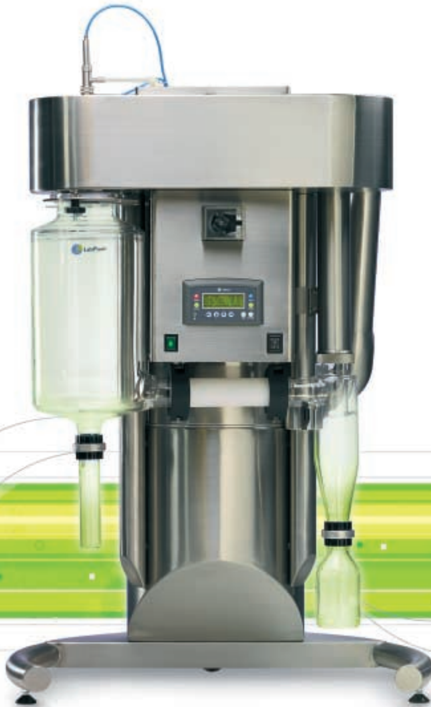
SD-06AG Laboratory Scale Spray Dryer FOR USE WITH AQUEOUS AND SOLVENT BASED SOLUTIONS