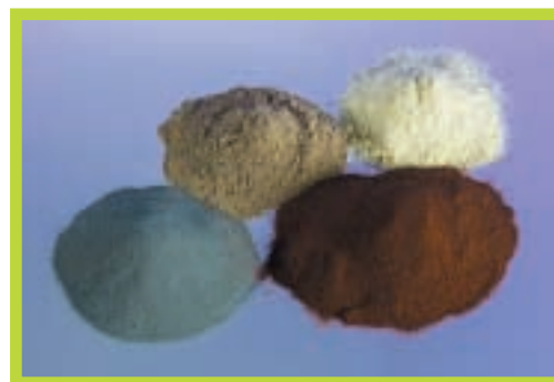
The Spray drying process usually produces a free flowing powder sample.

The Spray Drying process usually produces a free flowing powder sample of a spherical nature and can produce very fast results from a small liquid sample.