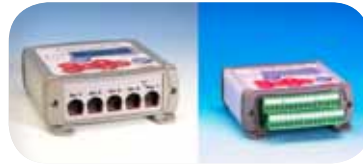
Models with mini-Din inputs and sensors self-recognition feature and models with terminal input board are available

user-defined constants and other derived quantities This library also includes mathematical calculations (see Calculated Quantities ).