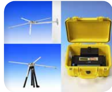
Wall mounting, tripod and IP65 box mounting accessories.

The distance between MASTER and SLAVE is 300 m (Line-of-sight) and it may decrease in presence of obstacles. LSI LASTEM supplies SLAVE units with “repeater” feature to increase radio distance.