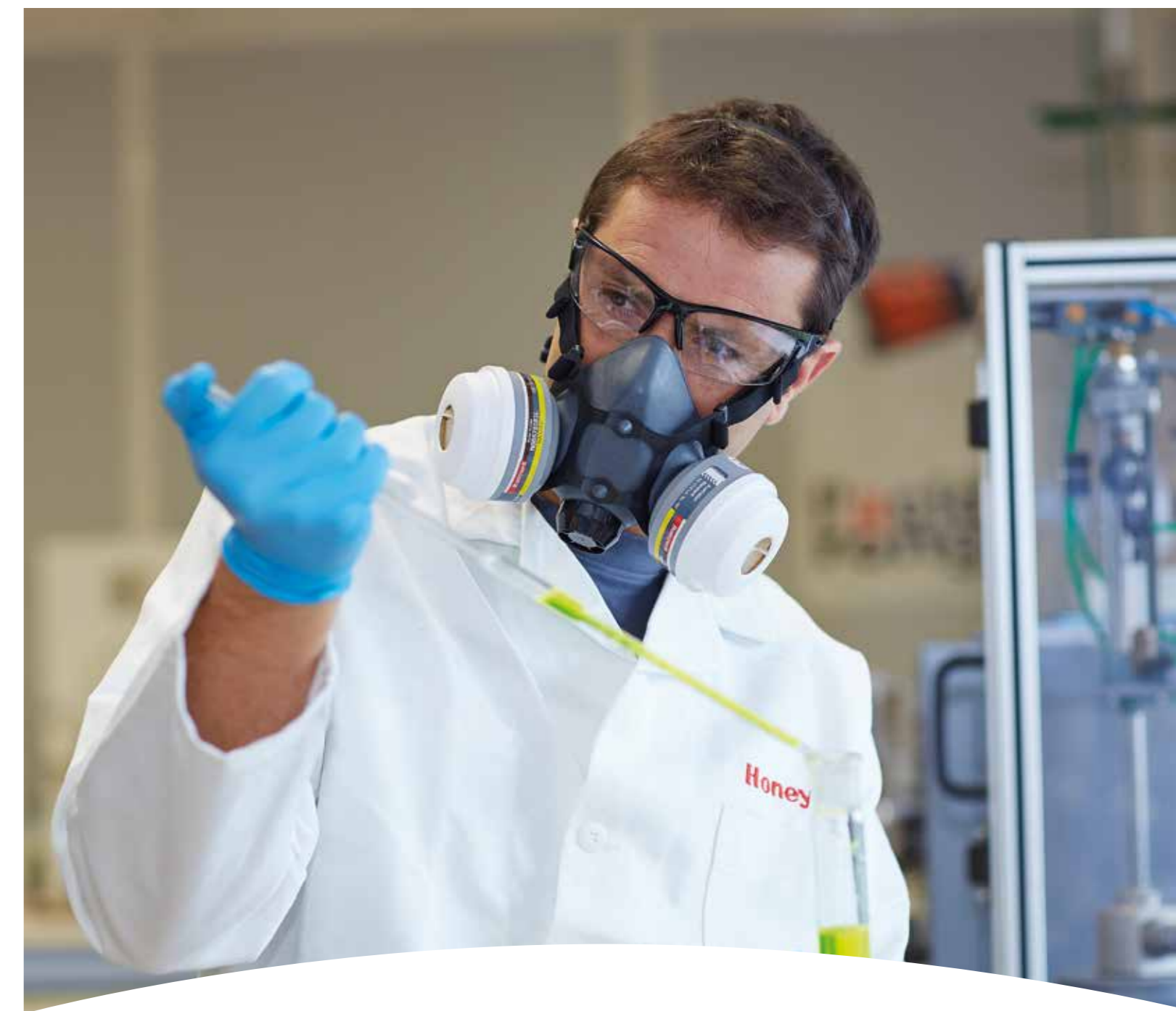
COMFORT, PROTECTION, FLEXIBILITY

Lead them to safety — Build an enduring culture of safety through comprehensive education, innovative technologies, and comfortable, high-performance products that inspire workers to make safer choices on their own. Honeywell Safety Products is the ideal partner for organizations committed to a cultural transformation that minimizes injuries and maintains a safer, more productive workplace.