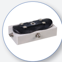
SA 105 Calibration Adapter to SV105 and SV105F