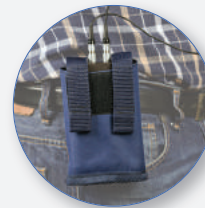
SA 89 Belt Bag for SV 106A