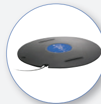
SV 38V Whole-Body Vibration Accelerometer