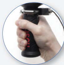
SV 150 Tri-Axial Hand-Arm Vibration Accelerometer