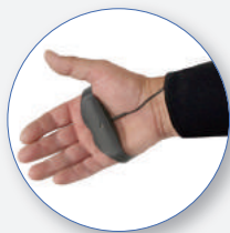
SV 105 Tri-Axial Hand-Arm Vibration Accelerometer

MEMS accelerometers which have many advantages including shock resistance, no DC-shift effect, very low power and frequency response down to DC.