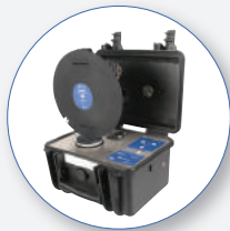
SV 111 Hand-Arm and Whole-Body Vibration Calibrator