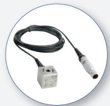
SV 151 Tri-Axial SEAT Vibration Accelerometer