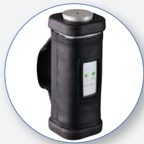
SV 110 Hand-Arm Vibration Calibrator