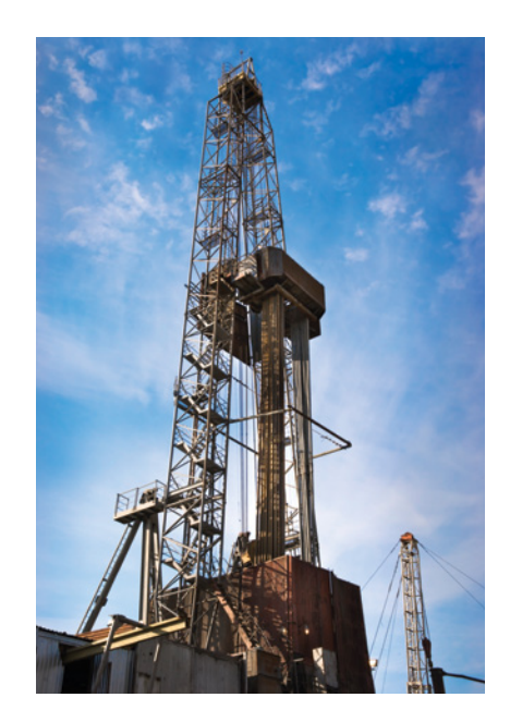
MeshGuard wireless gas detectors are designed for use in the harshest outdoor environments such as drilling rigs and in other industrial applications