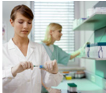
Clinics / University Hospitals