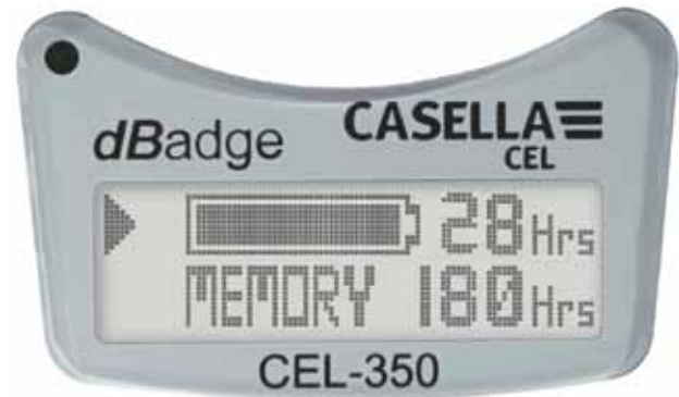
'Fuel gauge' display for memory and battery information

The dB Badge Series is the first compact noise badge product to be designed with a display. This internal display makes it easy to perform calibration, provides status information and shows key measured data. The dB Badge has a unique 'fuel gauge' to display memory and battery status, ensuring the exact remaining battery and memory capacity can be viewed on the display. Also a unique feature of the dB Badge is the alarm function. An ultra-bright LED on the dB Badge gives a visual indication of when exposure action levels have been exceeded by flashing at different rates. These action levels can be configured via the Insight software and used to instantly see if noise control or hearing protection measures are needed. The alarm function can be switched on or off via the dB Badge keys.