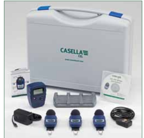
A typical measurement kit

For software to go with the d Badge kits, please refer to Casella Insight data sheet.