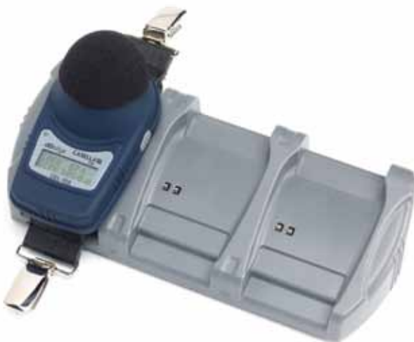
The CEL-6362 3-way charger with 1 dBADGE

A single CEL-6362 3-way charger is required. The number of charging points can be increased using the CEL-6363 3-way charger extension kit. Up to 12 dBADGE units can be charged in this way.