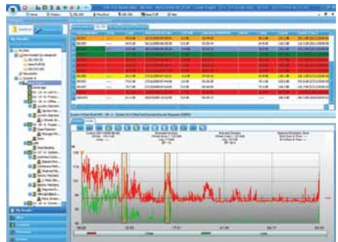
Tree style database of results with colour coding for exceeded noise action levels