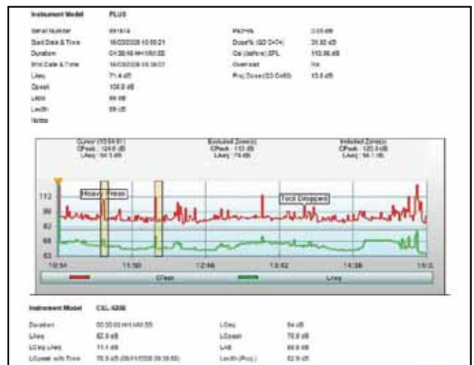
An example of a run report