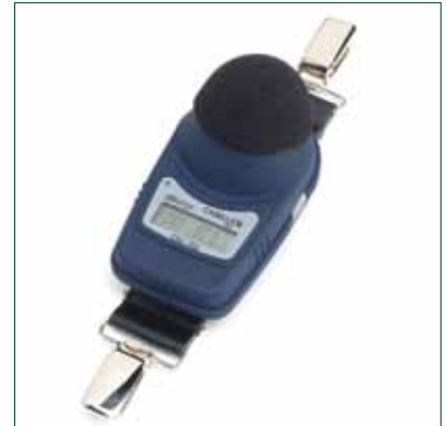
dBADGE with CEL-6352 Crocodile Clip Kit