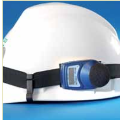
Mounted on a hard hat using CEL-6354