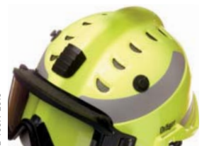
XL special rotating wheel