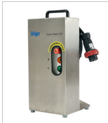
Dräger X-zone® Switch Off

The accessory Switch On or Switch Off box provides a cost-effective, fast and easy way of increasing safety during external work in Ex-zone 1. In the event of an alarm, the Switch Off box automatically cuts off the power supply in just seconds, for instance, to a welder. In the case of danger, the Switch On box responds immediately by activating, for instance, a traffic light for access control or a fan for ventilation. The corresponding switching station can be easily connected to the Dräger X-zone 5500 via the potential-free alarm contact.