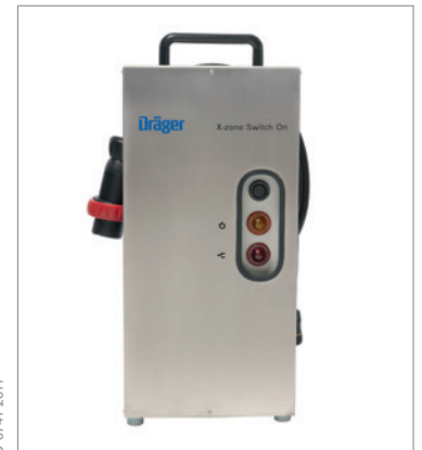
Dräger X-zone® Switch On