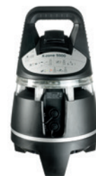
Dräger X-zone® 5500 Front view