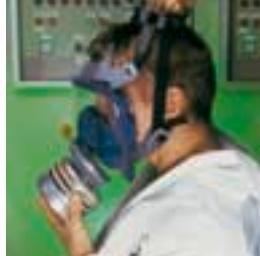
Pull the straps over your head