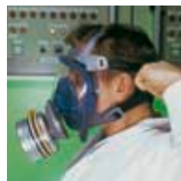
Tighten the straps