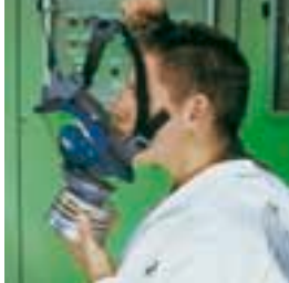
Put your chin into the chin stop