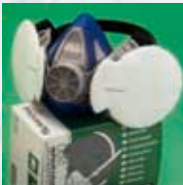
Particle, Gas and Combination Filters for the Advantage 200 LS

For storage and transport of the mask, the Advantage belt pouch provides a perfect solution.