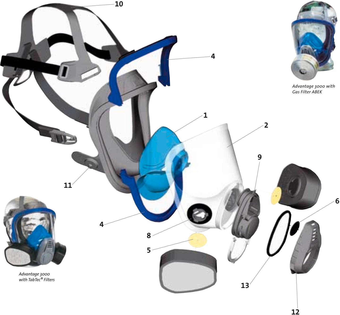
Advantage 3000 with Gas Filter ABEK

With its exclusive design, the Advantage 3000 is one of the easiest-to-use masks on the market. It solves all comfort problems and its maintenance is easy to learn. All components can be replaced without tools in a matter of seconds.