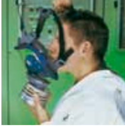
Put your chin into the chin stop