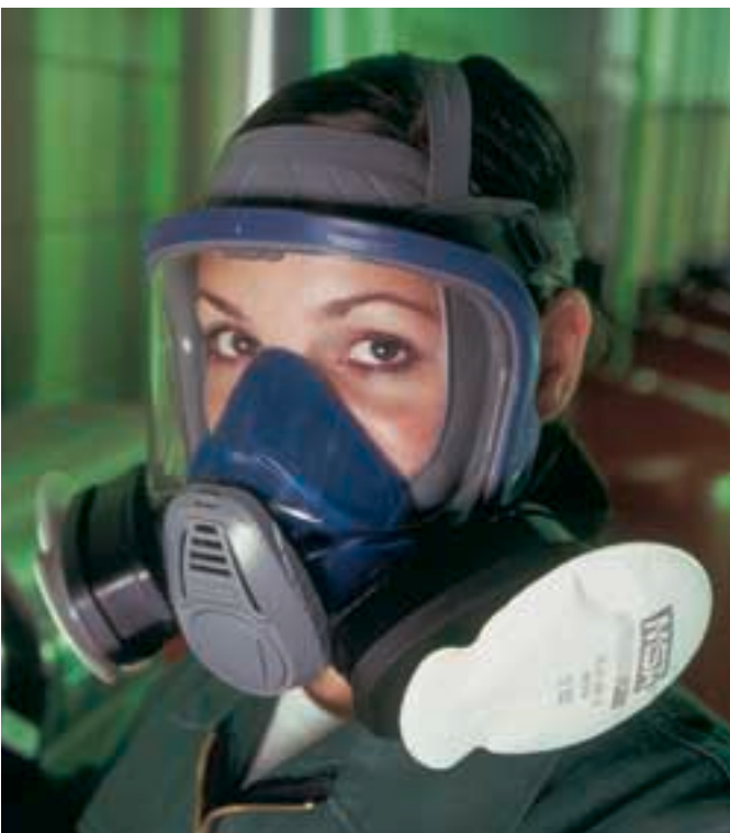
Advantage 3200 with TabTec® and FLEXIfilters

The masks in the Advantage series are fitted with the innovative TabTec® and FLEXIfilters. These filters protect against toxic gases, vapours and particles.