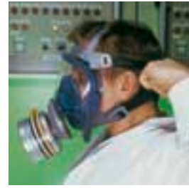
Tighten the straps