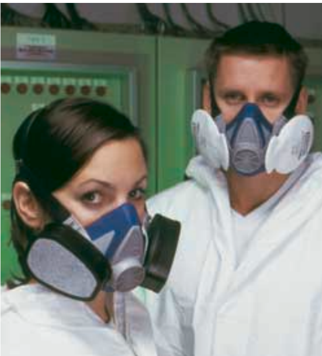
The Advantage 200 LS respirator

MSA has improved the Advantage 200 respirator even further. The result is the high-performance, economic and easy to handle Advantage 200 LS respirator.