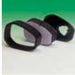
TabTec® Filter in Detail