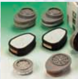
Particle, Gas and Combination Filters for the Advantage 200 LS