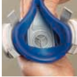
The facepiece-to-face Anthrocurve