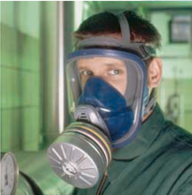
Advantage 3100 with Gas Filter ABEK

The MSA Advantage 3000 series of full face masks sets new standards for protection and unparalleled comfort. This innovative full face mask was developed to meet the high quality standards in Europe and North America.