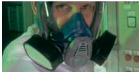
Advantage 3200 with TabTec® Filter

Gas filters against toxic or odourless gases must be replaced after a single use. The end of the service life of particle filters becomes apparent when breathing resistance increases.