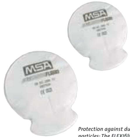
Protection against dust and particles: The FLEXifilter

The service life of respiratory filters depends on the ambient atmosphere, the user and the conditions of use. Gas filters must be replaced at the latest when odour, taste or irritation is detected.