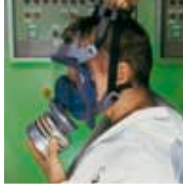
Pull the straps over your head