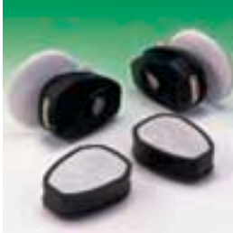
TabTec® with FLEXifilters