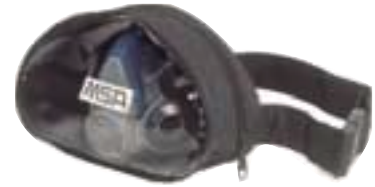
The convenient belt pouch is ideal for storing and carrying the Advantage 200 LS and its filters