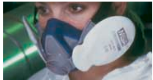
Advantage 200 LS with FLEXifilter

Gas filters against toxic or odourless gases must be replaced after a single use. The end of the service life of particle filters becomes apparent when breathing resistance increases.