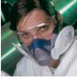
Advantage 200 LS with FLEXifilter