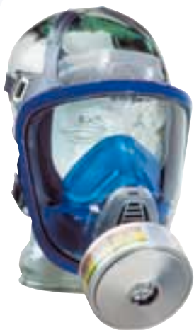
The Advantage 3000 is available with single EN or twin Advantage filter ports

Like the Advantage 200 LS, the Advantage 3000 can be fitted with the latest in filter technology.