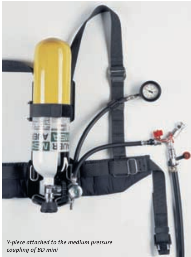
Y-piece attached to the medium pressure coupling of BD mini