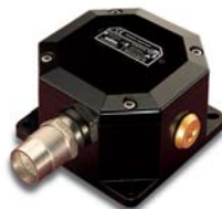
P/N B13-020, ATEX, polyester housing