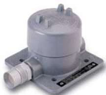
P/N 10252-1, CSA, explosion-proof housing