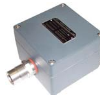
P/N B13-021, ATEX, high temperature housing