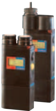
EX-OX-METER II Calibration:

Measuring range: LEL, Vol.-% and leak detection. Part no. on request