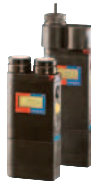
EX-OX-METER II Calibration:

Measuring range: LEL Standard type: Part. no. D6172725 Pump type: Part. no. D6172726