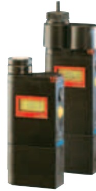
EX-METER II Calibration:

Measuring range: LEL Standard type: Part. no. D6172705 Pump type: Part. no. D6172706