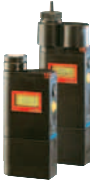
EX-METER II Calibration:

Measuring range: LEL, Vol.-% and leak detection. Standard type: Part. no. D6172703 Pump type: Part. no. D6172704