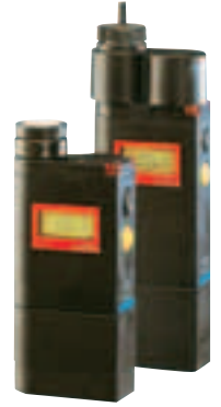
EX-METER II Calibration:

Measuring range: LEL and leak detection. Standard type: Part. no. D6172709 Pump type: Part. no. D6172710