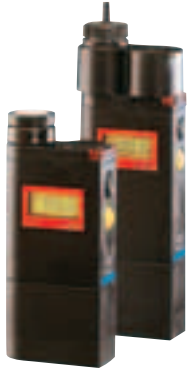
EX-METER II Calibration:

[ All calibrations and versions at a glance ]