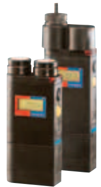
EX-OX-METER II Calibration:

Measuring range: LEL and leak detection. Standard type: Part. no. D6172729 Pump type: Part. no. D6172730