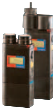
EX-OX-METER II Calibration:

Measuring range: LEL, Vol.-% and leak detection. Standard type: Part. no. D6172723 Pump type: Part. no. D6172724