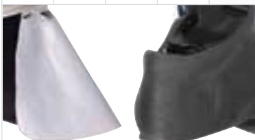
Aluminised or Wool-Nomex neckcurtains