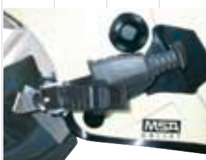
Facemask rapid fitting system