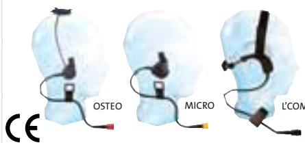
An integrated communication system