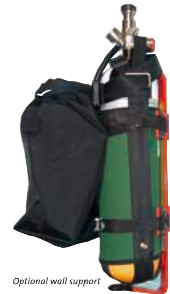
Optional wall support