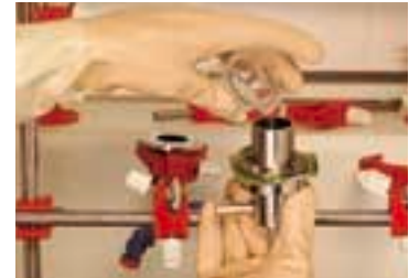
In laboratory tests the permeation times of chemicals are determined. The Vautex Elite resists even toluene, 96% sulfuric acid, chlorine or ammonia for over 8 hours and in almost every case reaches the highest standard class.