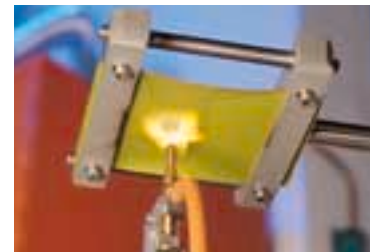
The resistance against heat and brief flame contact [5 sec.] is exceptional. The flame to which the material is subjected has a temperature of above 800 °C. The Vautex Elite material holds up and the flames self extinguish immediately after the test flame is removed.