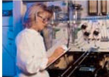
EN 943-2 has enlarged the number of test chemicals from the VFDB guideline. The permeation of these chemicals is tested in extensive laboratory tests.

An integrated transponder allows state of the art identification and administration of the equipment.