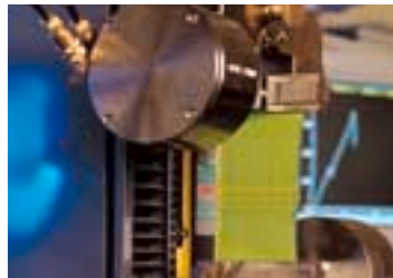
The EN 943 Part 1 and 2 requires a multitude of mechanical tests. The seam is subjected to a tear test, and there also are tests for puncture resistance, abrasion and flex cracking resistance.