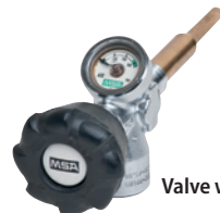
Valve with Gauge